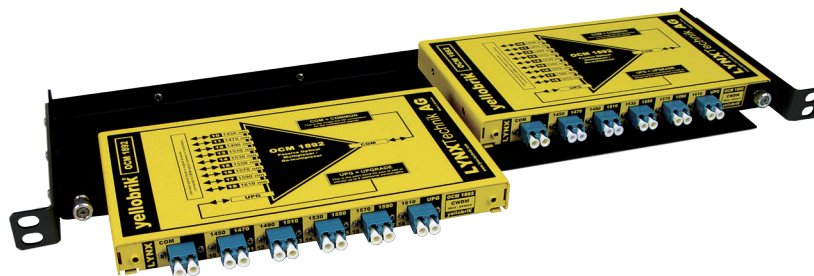
Optional RFR 1018 ½ RU 19" Rack chassis with 2 x OCM modules