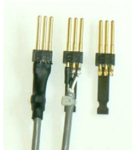
Solder-Lug-Connector GAS 323 LA C 673.910.311.01

Therefore GHIELMETTI developed the new Solder-Lug-Connector GAS 323 LA C .