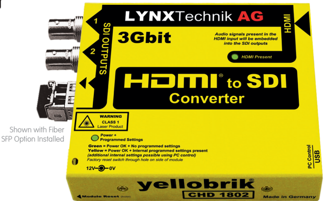
Shown with Fiber SFP Option Installed